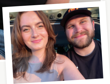
with my husband